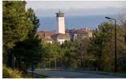
Koç University, Turkey