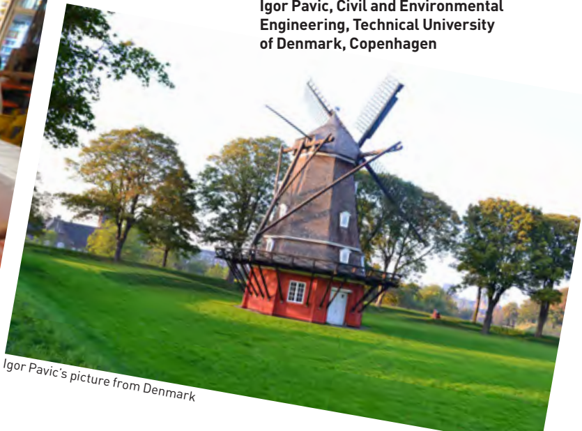
Igor Pavic's picture from Denmark