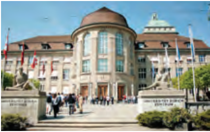
University of Zurich, Switzerland