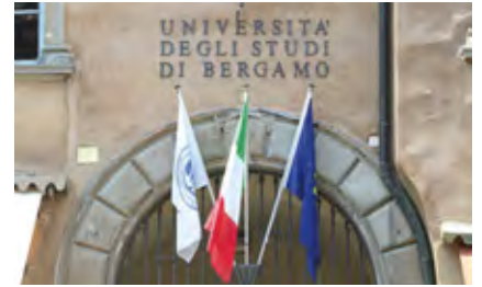
Università degli Studi di Bergamo, Italy