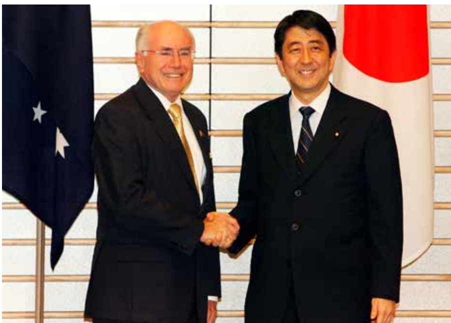
Visiting Australian Prime Minister John Howard is welcomed by Japanese Prime Minister Shinzo Abe prior to their talks at the Prime Minister's official residence in Tokyo - 13 March 2007.

On the back of collaboration in post invasion Iraq and the 2004 Boxing Day Tsunami and propelled by a shared sense of the need for America's allies to begin to do more with one another, Australia and Japan have begun to develop a close security relationship. This has involved both formal elements, with four agreements relating to security cooperation signed since 2007, as well as a wide range