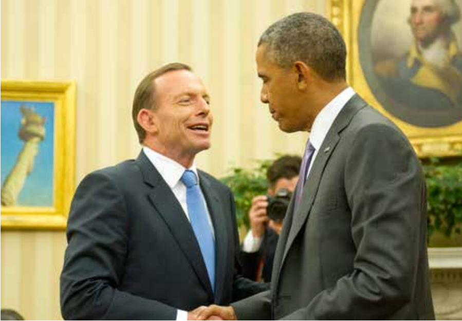
US President Barack Obama shakes hands with Prime Minister Tony Abbott of Australia in the Oval Office the White House in Washington DC - 12 June 2014.