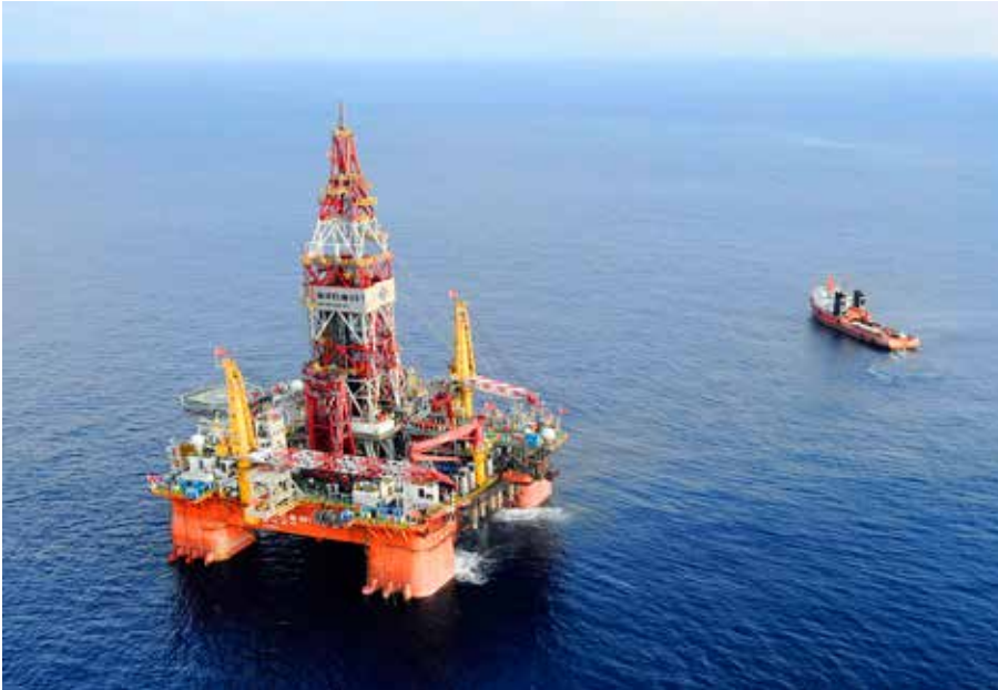
Haiyang Shiyu oil rig 981 in the South China Sea.