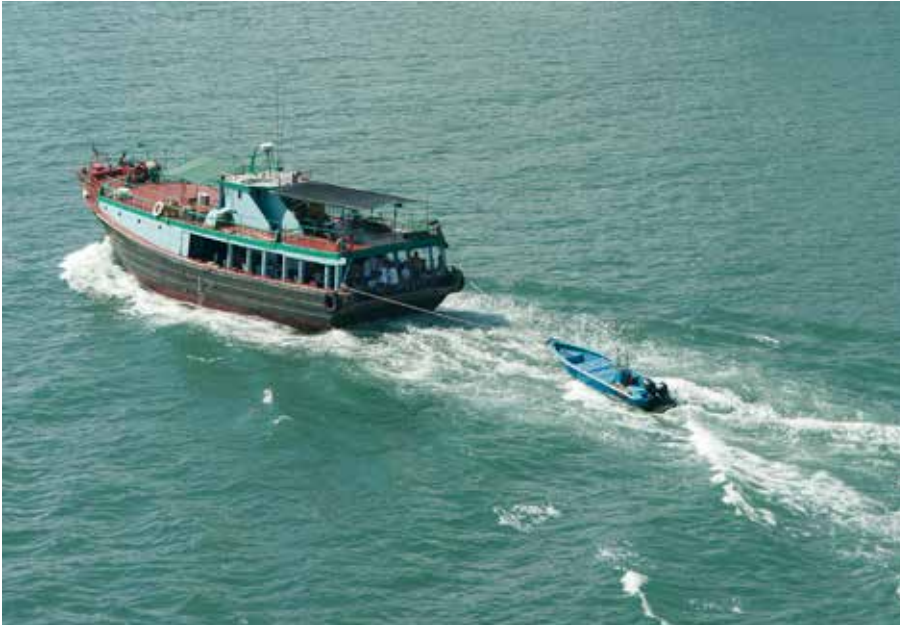
Chinese fishing vessel sailing in China's coastal waters.