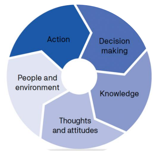
Figure 1: Community Resilience Framework

The framework is a tool to guide research, program design and implementation, strategic policy, and evaluation.