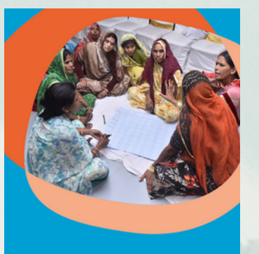
Partnerships for Transformation: Guidance for WASH and Rights Holder Organisations

This paper investigates the intersectional aspects that influence the experiences of female entrepreneurs in WASH sector business activities in Eastern Indonesia.