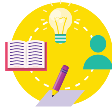
Wellbeing and positive psychology education