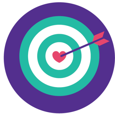
Pursue meaningful goals, coached by your manager