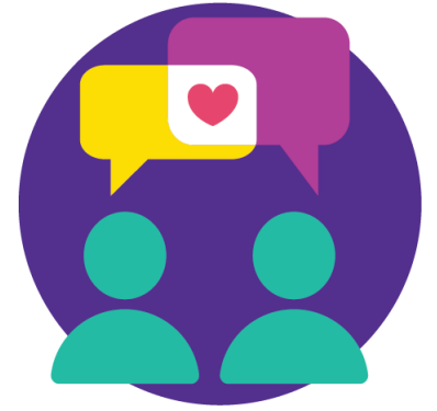
Positive psychology coaching