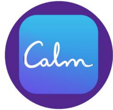
Premium Calm subscription