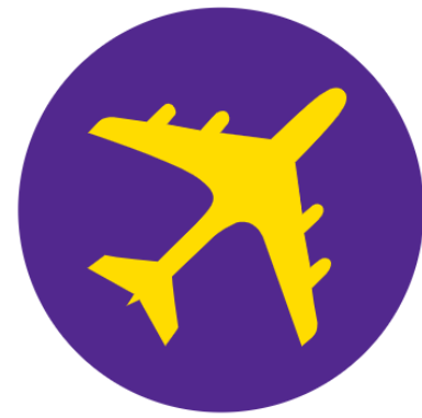
Work anywhere in the world