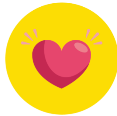
Best Self leave days

Examples of additional support offered as part of our holistic approach to mental health and wellbeing: