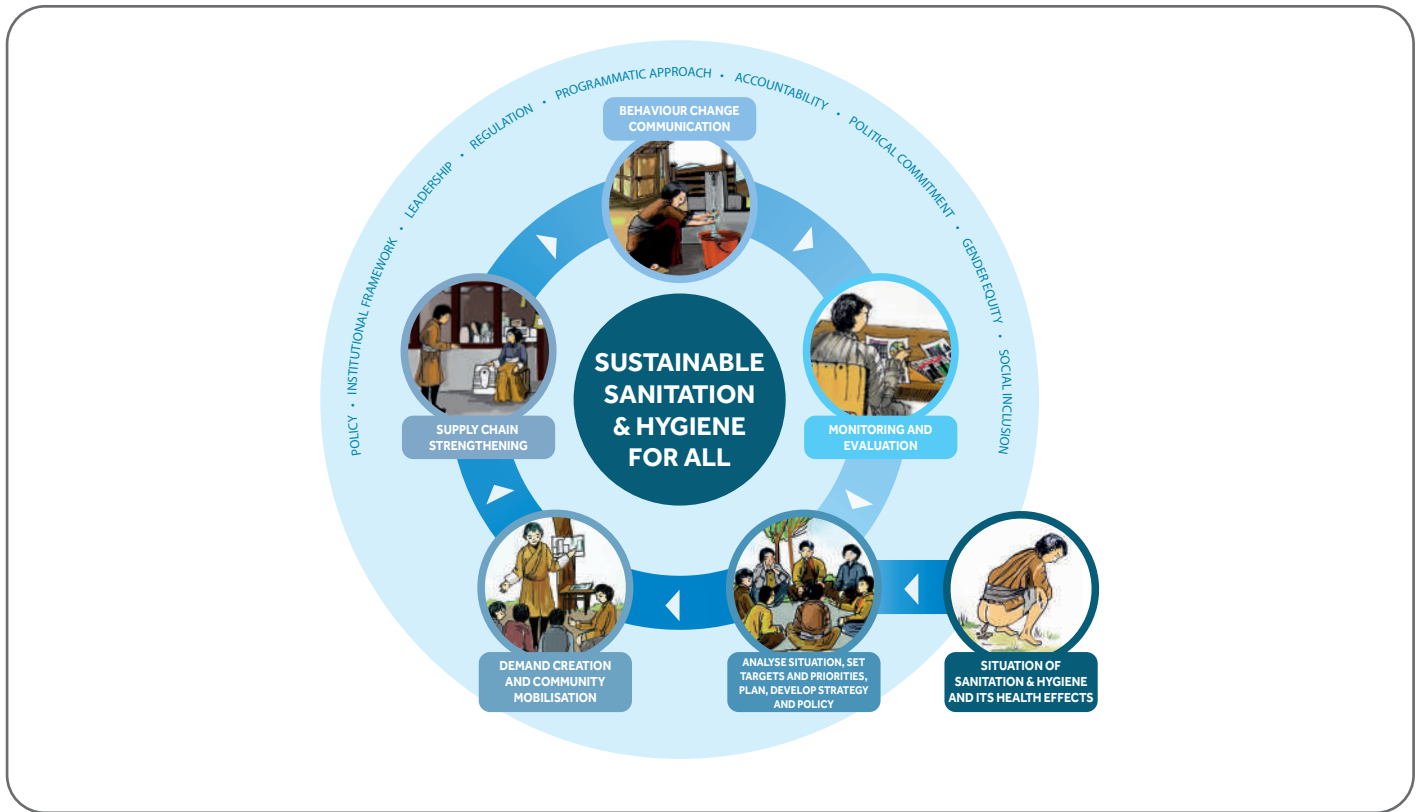
Figure 2: Bhutan National Rural Sanitation and Hygiene Programme framework 16