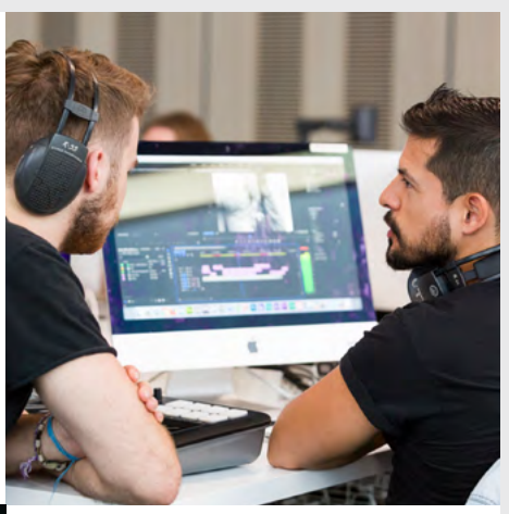
INTERNSHIP OPPORTUNITIES Go beyond the classroom and apply your skills in professional contexts. We have partnerships with leading industry players such as Animal Logic and Flying Bark Productions, and projects like VIVID Sydney and the Australia Piano Quartet.

Create innovative multimedia content alongside students from degrees across UTS, including Music and Sound Design, Games Design and Media Production. These collaborations give you a first-hand insight into what it's like to work as a creative professional.