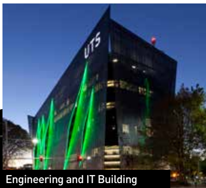
Engineering and IT Building