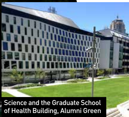
Science and the Graduate School of Health Building, Alumni Green

Hone your advocacy skills in our purpose built Moot Court and trial courts that have been designed to reflect the real-life courtroom experience of the NSW Supreme, District and Local Courts.