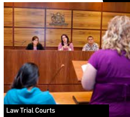
Law Trial Courts