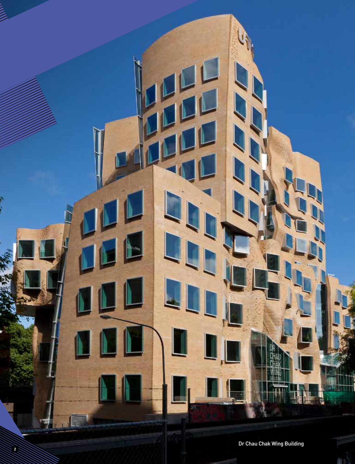
Dr Chau Chak Wing Building